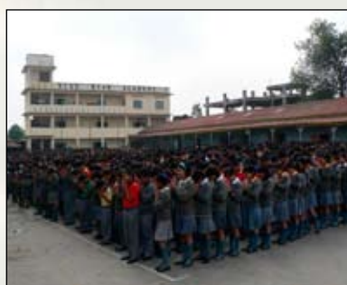
The evening before the series in Manipur would start, we got a 10 day permit. In the afternoon we reached the town Churachandpur, where the meetings would be held. Three lay Adventists run 3 schools with more than 2000 students in total. The schools have broken down much prejudice.