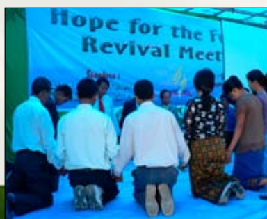
The little group of Adventists in Churachandpur had done a wonderful preparation work. For the first time they would get missionary visitors from abroad. They were so thankful! The campaign was borne on the wings of prayer.