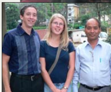
The prelude to the India trip happened during a camp-meeting in Kenya in 2007. The Union president of North East India was also a speaker. He invited us to come and do an evangelistic meeting series in his district.