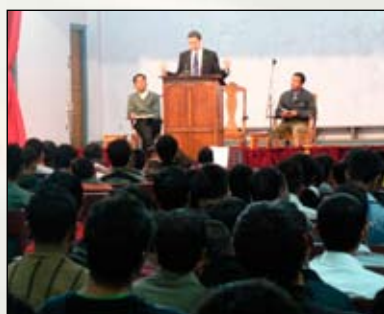
We were appointed the province Manipur. This is a turbulent area with recognised terrorist groups. It is termed a 'restricted area', where few foreigners enter. While waiting for our permit, we visited ATS - an Adventist Seminary in the province of Assam.