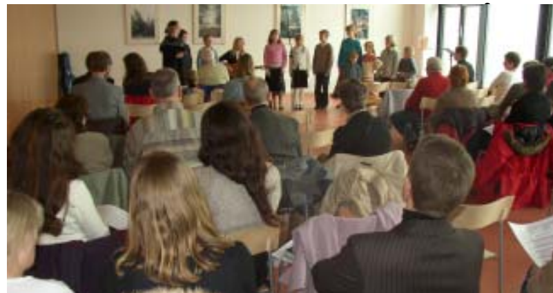
The first Sabbath-gathering with new friends from the campaign.