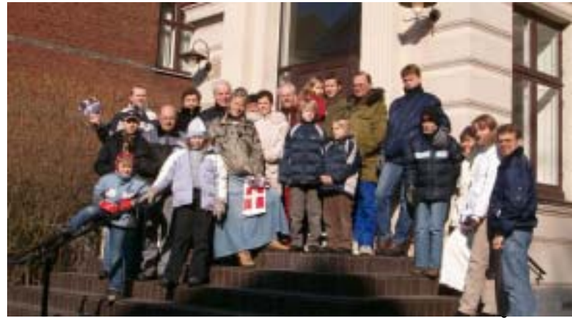
Ready for action: Some of those who took part in the preparation-work.

Contact us: danielsilvia@combitel.no stinegro78@hotmail.com