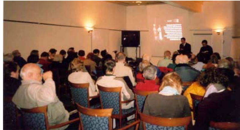
The hall was packed the first night. People were even sent away from the reception. No doubt we had to find a new locality!