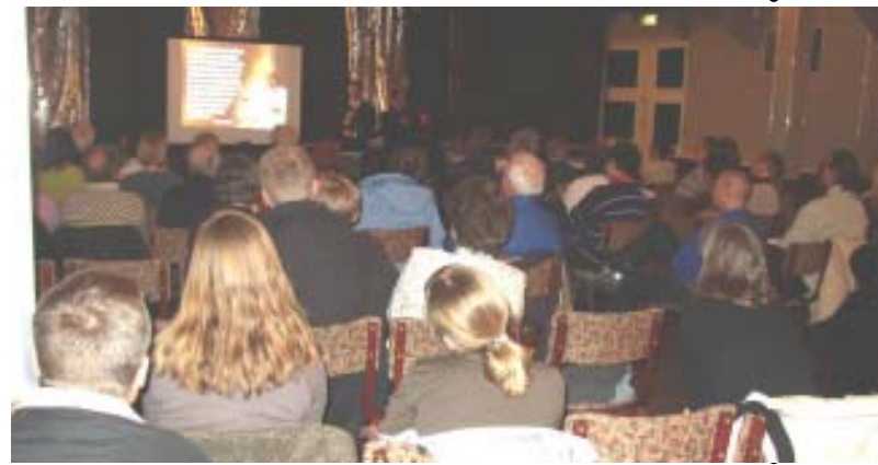
The next 7 nights we gathered in 'Søpavillonen' - a nice hall seating 120 people.